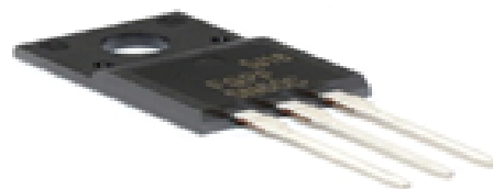
Fig3.5 Field Effect Transistor