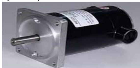
Fig 3.1 PMDC Motor

In fig3.1, a PMDC motor, an armature rotates inside a magnetic field. The basic working Principle of a PMDC motor is based on the fact that Whenever a Current carrying conductor is placed inside a magnetic field, there will be mechanical force experienced by that conductor.