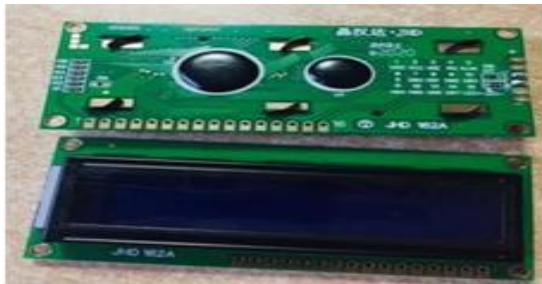
Fig 3.2: LCD Screen

The 16 x 2 intelligent alphanumeric dot matrix display is capable of displaying 224 different characters and symbols. This LCD has two registers, namely, Command and Data. It is a display device used in embedded system to display information. It contains