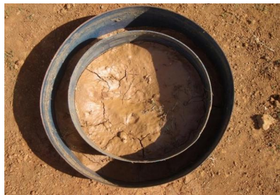
Fig. Double ring infiltration

Double ring infiltrometer is used to conduct the test in certain places of Hakankawadi like lake side, forest area, mundhewasti. Area of 2m by 4m was taken in all the places. The two cylinders are placed inside the soil but the measurement is taken in the inner cylinder only; the outer cylinder helps the water from the inner cylinder to flow vertically downwards and not horizontally. The cylinders are of height 60cm which are been digged up to a height of 20cm inside the soil using steel rod and hammer. Figure 1 shows the infiltrometer that has been used in this experiment with inner diameter 15cm and outer diameter 30cm. Cylinders are kept back 40cm above the ground surface in which the water was filled and the decreasing water level measurement was taken. Water is supplied evenly inside the ring without any disturbance of soil surface. A measuring scale of 30cm is placed in the inner cylinder and the initial water level of the inner cylinder is written down. The measurement was kept going until and unless a constant value of infiltration rate was reached . Two minutes and four minutes time interval and a total of 90 minutes were taken and the decrease in the water level was measured. The water level in the outer cylinder is kept at the same level as the water level in the inner cylinder.