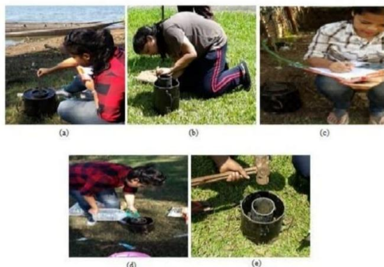
Fig. Process of Infiltration Process

down the readings, Figure 2(d) shows filling the cylinders with water and Figure 2(e) shows the digging of cylinders into the soil. These pictures also show the different sites where the experiments have been carried out and with different soil cover.