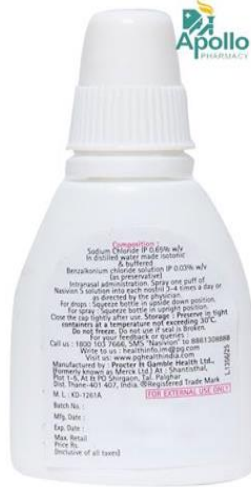
Fig : Nasal drop.

1) Nasal Drops: The nasal drops are one of the maximum easy and handy structures advanced for nasal delivery. Due to smooth of self-management it's miles turning into greater popular. The primary downside of this device is the dearth of dose precision.