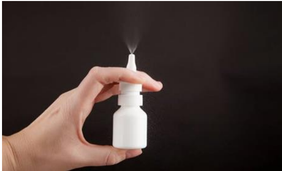
Fig : Nasal spray

2) Nasal Sprays: The answer and suspension each formulations may be formulated into nasal sprays. The availability of metered dose pumps and actuators, a nasal spray can supply an genuine dose. These are favored over powder sprays due to the fact powder outcomes in mucosal irritation.