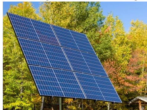
Figure 3: Solar Panel