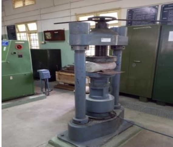
Fig 7. TESTING OF CYLINDER

The Cylinder were casted in the size 150mm X 300mm and the cast specimens were removed from mould after 24 hours. After curing the specimens for a period of 7, 14 & 28days.