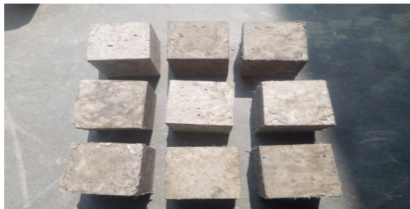
Fig3.DEMOULDING OF CUBE