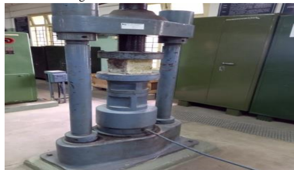
Fig4. TESTING OF CUBE

compressive strength of concrete at the age of 7, 14 & 28days.