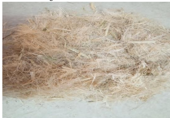
Fig 2. SISAL FIBRE