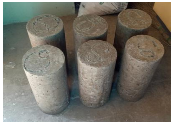
Fig 6.DEMOULDING OF CYLINDER