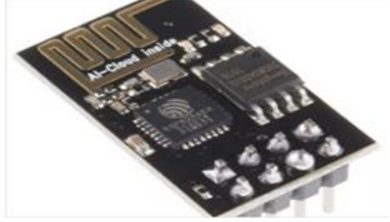
Fig. 5. ESP8266 WIFI module

3. ESP 8266 Wi-Fi Module : It is tone-contained SOC with an integrated TCP/ IP protocol mound that can give any microcontroller access to your Wi- Fi network. Analogue sources of Wi- Fi ESP 8266 module can host several operations and is cheap in terms of cost which can make the task of connecting the Wi- Fi readily through different commands.