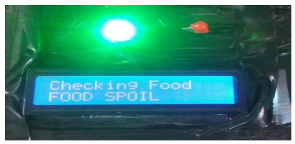
Fig. 10. Result