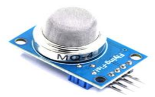
Fig. 4. MQ4 Methane Gas Sensor

3. ESP 8266 Wi-Fi Module : It is tone-contained SOC with an integrated TCP/ IP protocol mound that can give any microcontroller access to your Wi- Fi network. Analogue sources of Wi- Fi ESP 8266 module can host several operations and is cheap in terms of cost which can make the task of connecting the Wi- Fi readily through different commands.