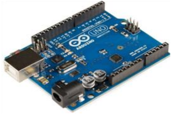
Fig. 3. Arduino UNO

1. Arduino Uno: The Arduino UNO (an open-source microcontroller) is a board that is grounded on the Microchip ATmega328P microcontroller. The board is supplied with sets of analogue and digital input/ affair I/O) legs that may be connived with colourful expansion boards(securities) and other circuits. The board is equipped with 14 digital I/ O pins/, 6 analogue I/O legs and is programmed with the help of Arduino IDE (Integrated Development Environment), via B-type USB string. USB string or an external 9-volt battery is used although it can tolerate 7 and 20V power supply.