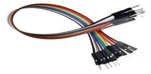
Fig. 9. Jumper Cables

7.Jumper Cables : Jumper cables are cables that have connector legs at each end, allowing them to be used to connect two points without soldering. Jumper cables are generally used with breadboards and other prototyping tools to make it easy to change a circuit as demanded.