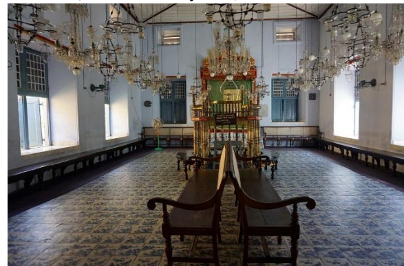
Figure 3 Paradesi Synagogue in Kochi