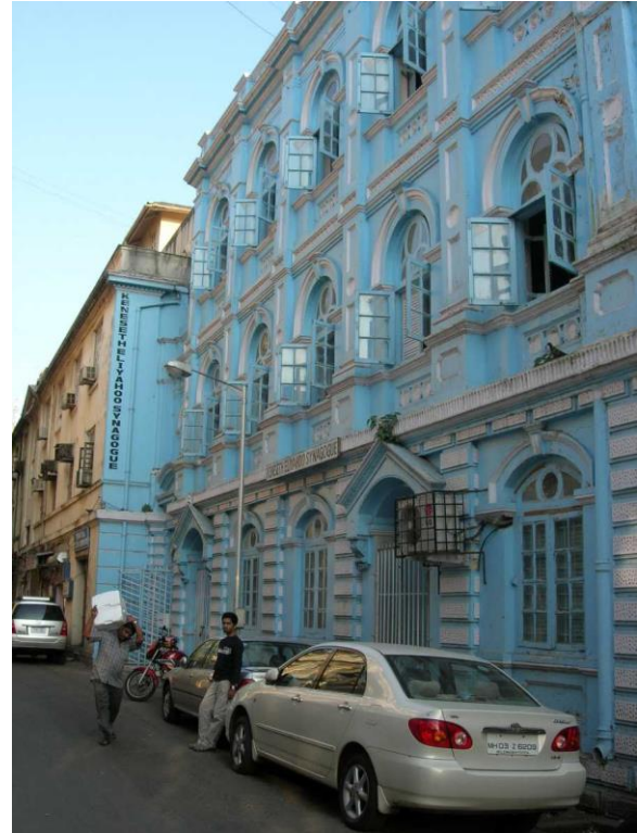
Figure 2 The Keneseth Eliyahoo Synagogue in Mumbai

restoration and conservation work have been carried out.