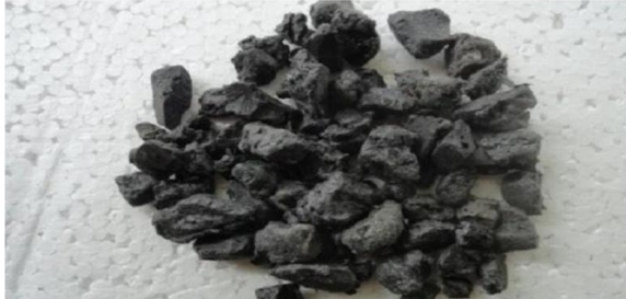
Fig.1 Plastic aggregates

After extrusion the molten plastic was collected approximately. These plastic boulders were crushed to the size of aggregates. The process of grinding the plastic materials plays a significant role in the beginning by improving mechanical properties of concrete.