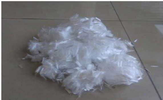
Fig.2 Polypropylene fiber

Polypropylene fiber is a synthetic fiber formed from a polypropylene melt. It has lower wear resistance. It displays good heat – insulating properties and is highly resistant to acids, alkalies, and organic solvents. Polypropylene is the lightest of all fibers and is lighter than water.