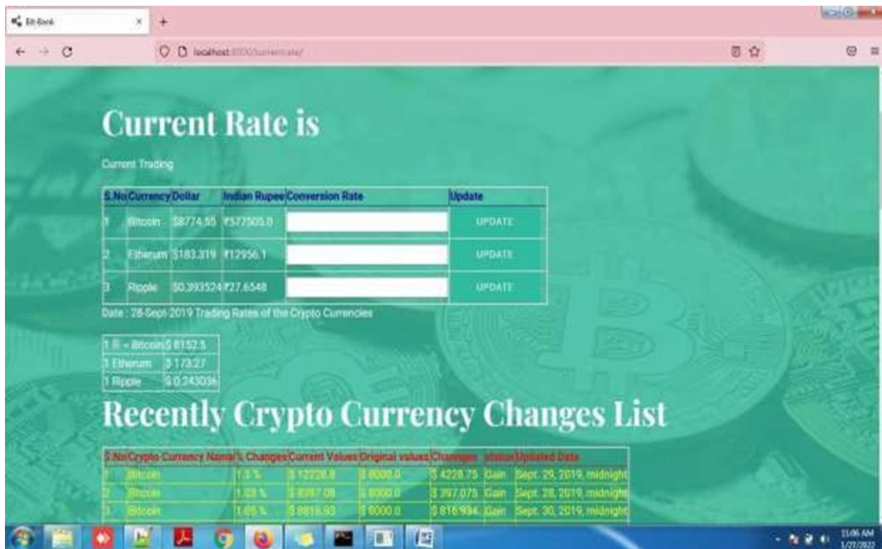
Fig. 7. Current Price and Update