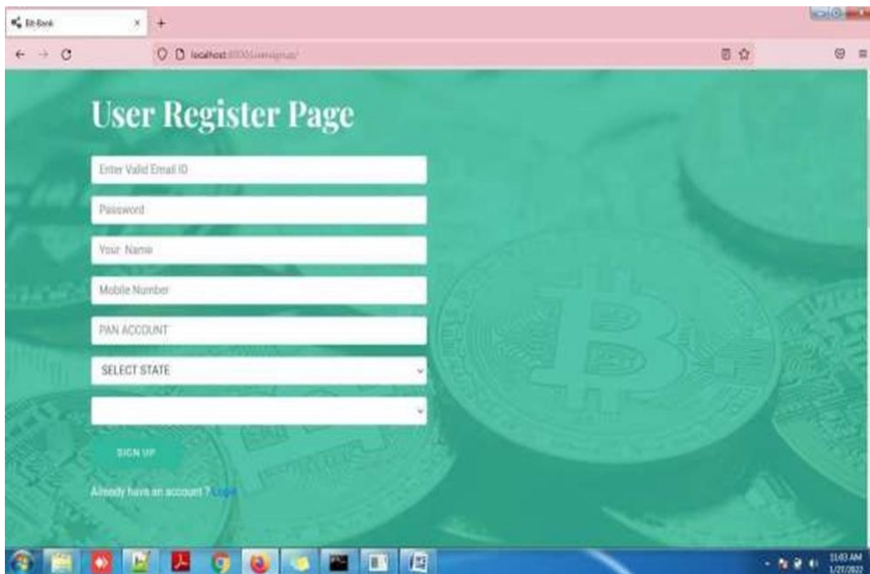
Fig. 3. User Register Page