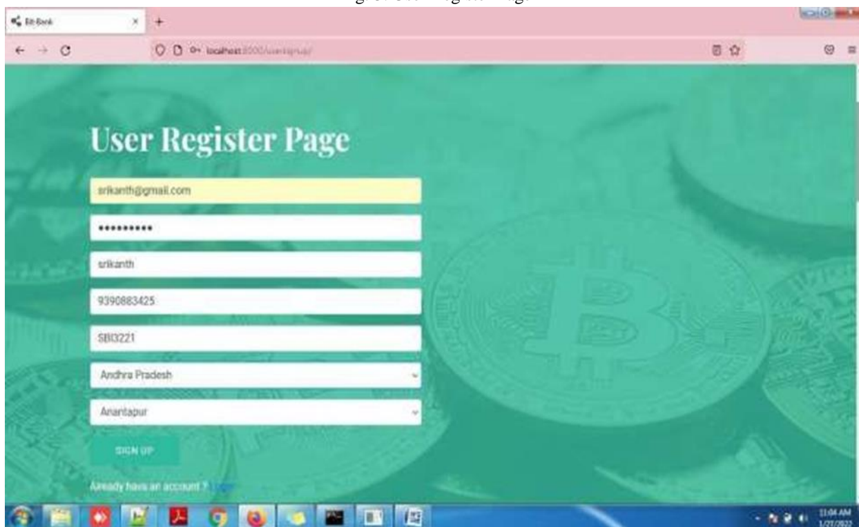
Fig. 4. User Register Page