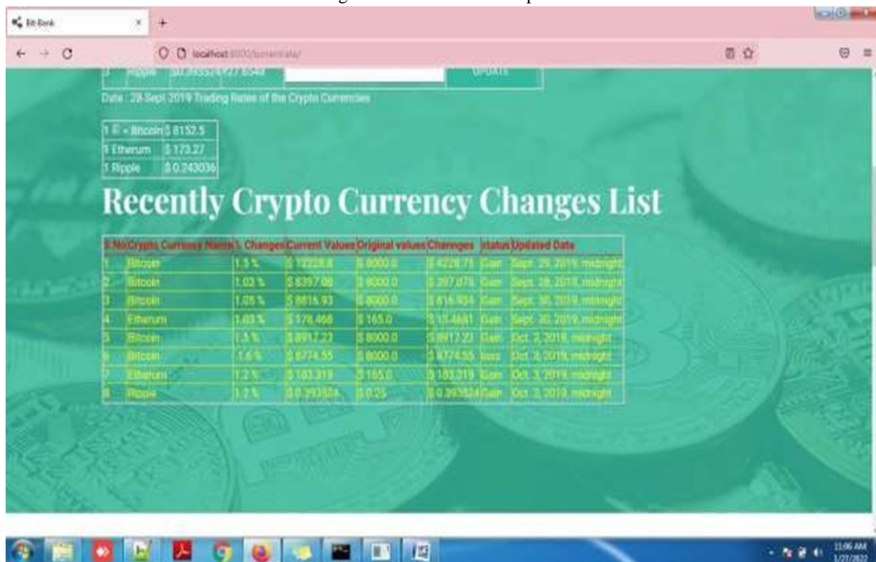
Fig. 8. Crypto Update History