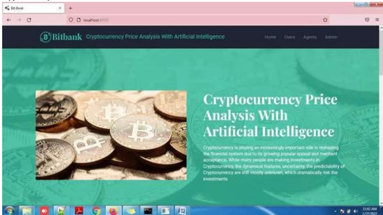
Fig. 1. Home Page of Cryptocurrency price analysis with artificial intelligence

cryptocurrency and time series also successful We can find the 100% result..