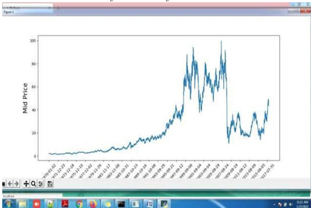
Fig. 10. Dataset Analysis