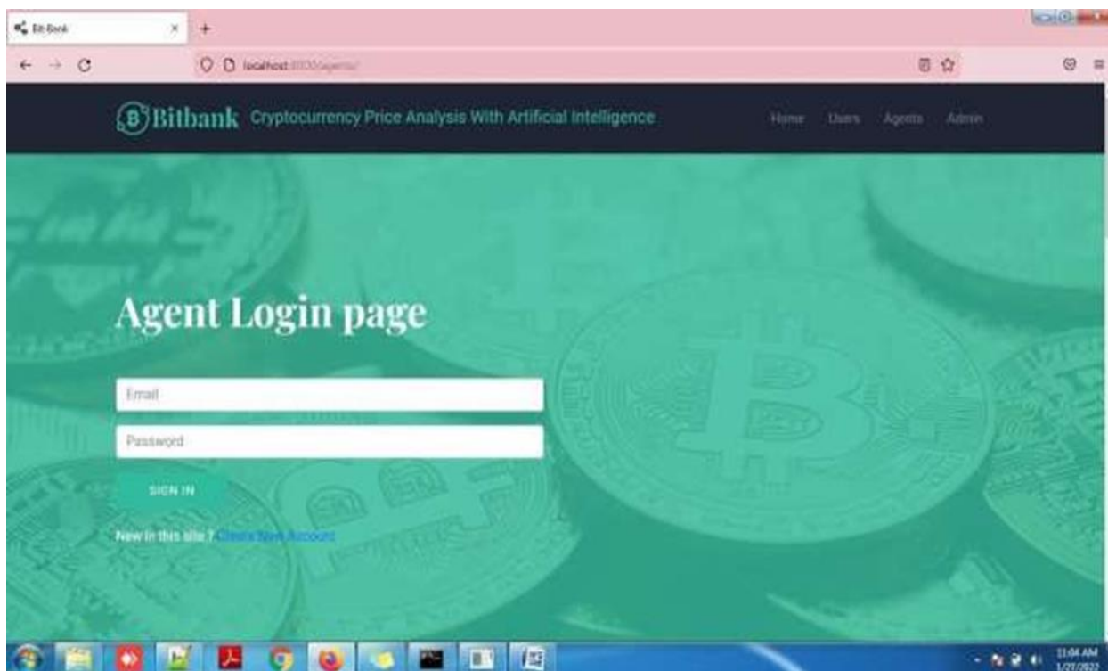
Fig. 5. Agent Login Page