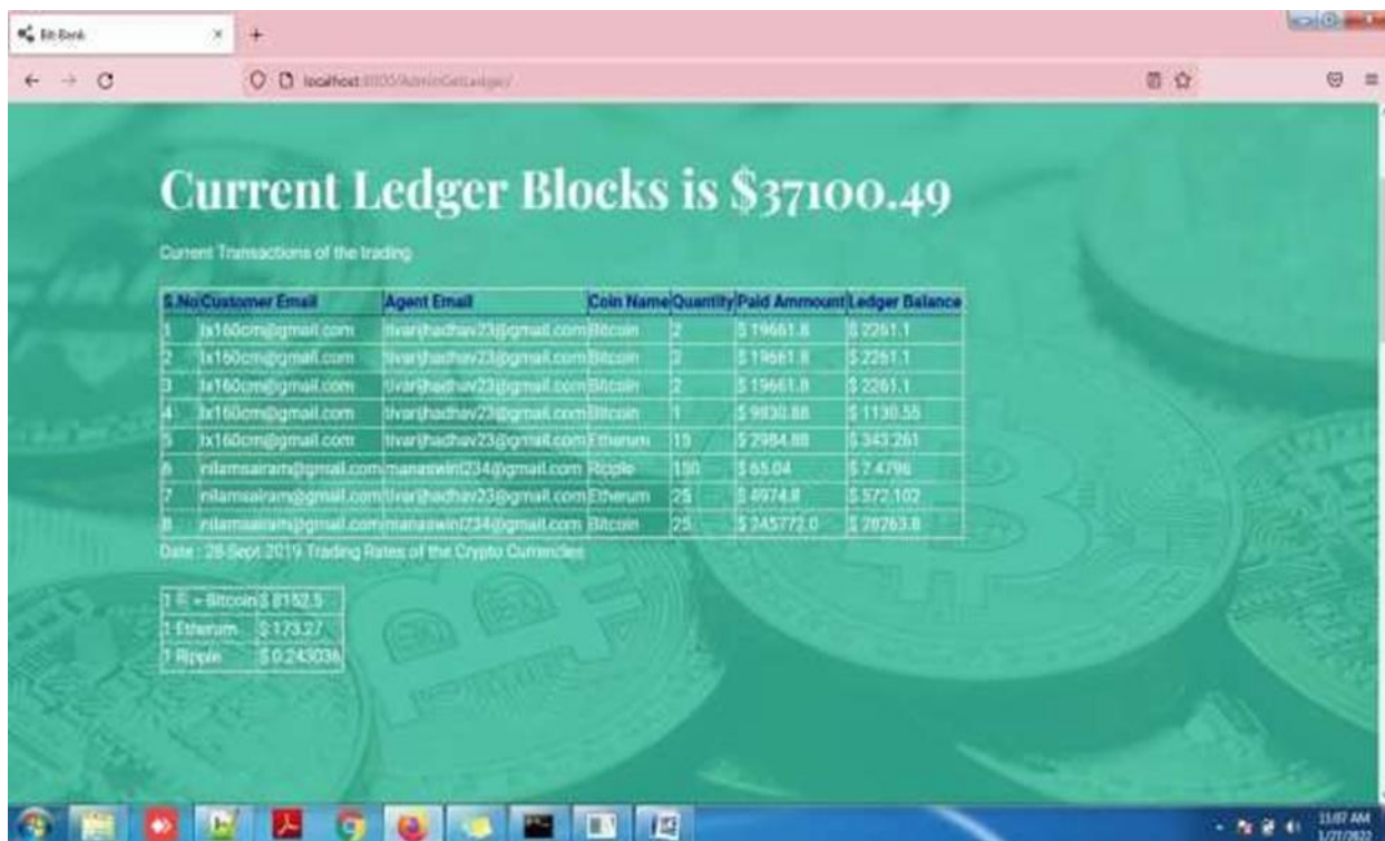
Fig. 9. Blockchain Ledger Maintenance