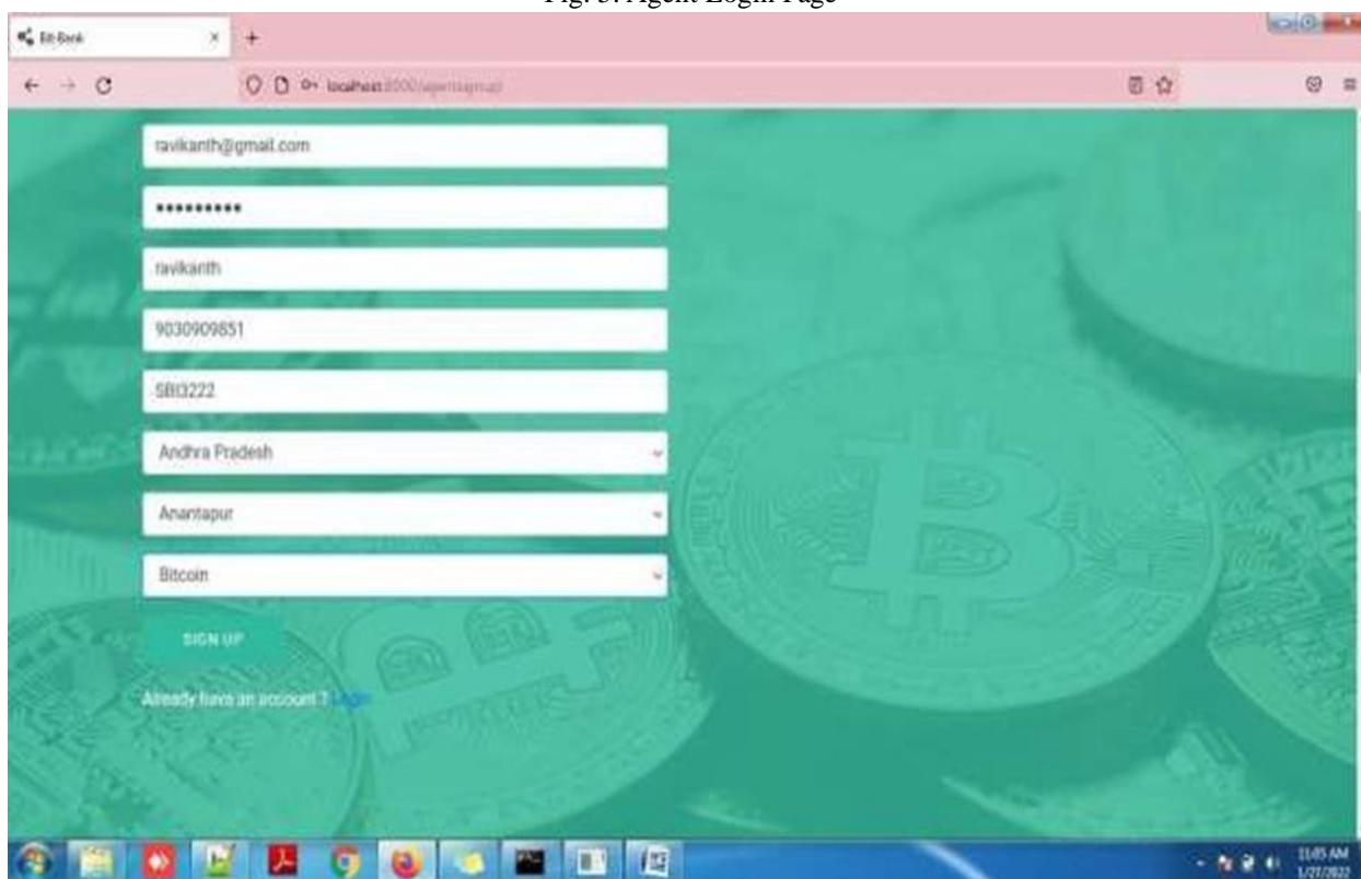
Fig. 6. Agent Register Page