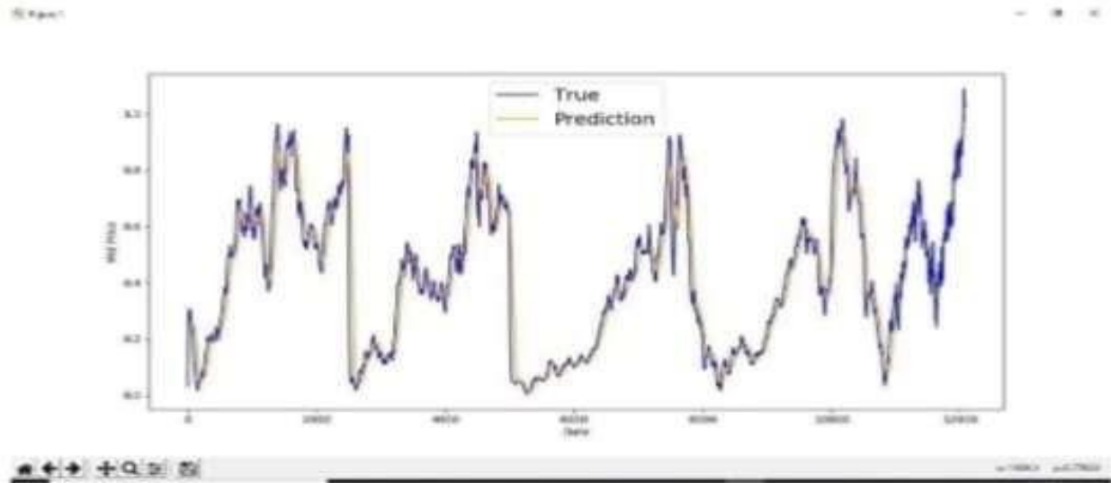
Fig. 11. True Prediction