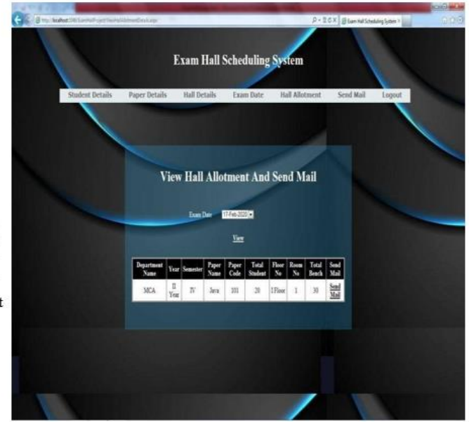
Fig.3 Interface Diagram

we create the no. of blocks. In that block, we add no. of desk and room number for that block. Then we can view the available blocks through block name. Finally, we allocate the hall for every exam based on the no. of students in each department class.