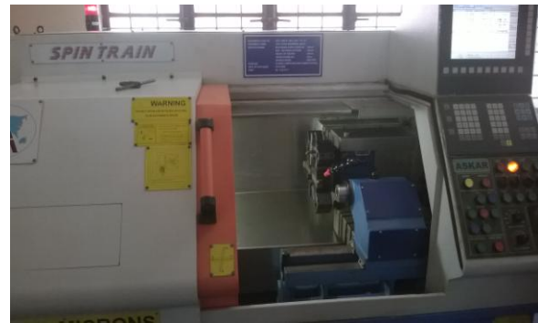
Fig. 1 CNC lathe SINUMERIK (802 D)