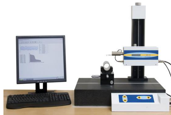
Fig. 2 TR1900 Surface Roughness Tester.