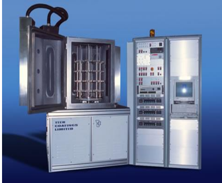
Fig. 4 PVD Vacuum Coating Machine

bombardment of the substrate to be coated with energetic positively charged ions during the coating process to promote high density. Additionally, reactive gases such as nitrogen, acetylene or oxygen may be introduced into the vacuum chamber during metal deposition to create various compound coating compositions. The result is a very strong bond between the coating and the tooling substrate and tailored physical, structural and tribological properties of the film.