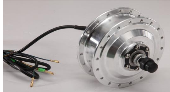
Fig- Hub Motor

Permanent magnets which are placed in a brushless DC motor, those magnets rotate around a fixed armature. An electronic controller replaces brush assembly of brushed motor turning. Brushless motor has more advantages than DC motor which includes more torque more weight and also torque per watt.