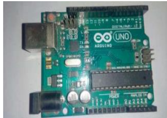
Figure 4. Arduino UNO.

Microcontroller will act as the brain of the robot. The robot movement will be decided by the microcontroller. In this system we will be using microcontroller named Arduino UNO which contains ATMEGA 328P microcontroller chip (Figure 1). The microcontroller is programmed with the help of the Embedded C programming. Arduino has its own programming burnt in its Read Only Memory (ROM). C program is very easy to implement for programming the Arduino UNO.