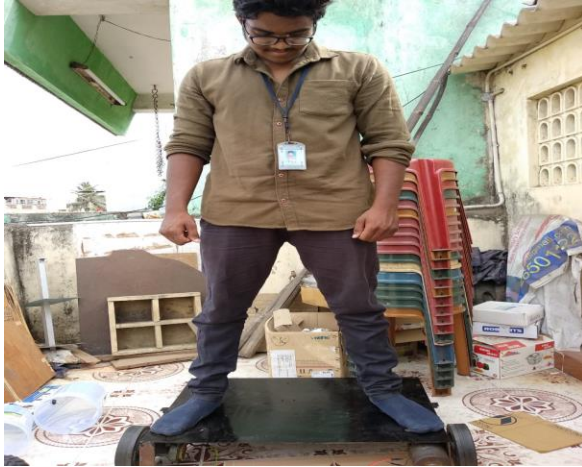
Figure.8. Fabricated Model