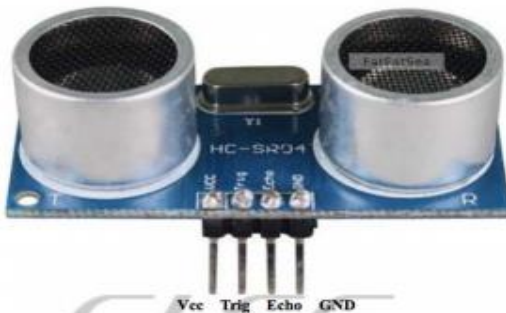
Figure 6. Ultrasonic Sensor

The object detection and distance measurement module performs the task of detection of objects and staircases and measures the distance to object/staircase. The detection of objects is at three levels, low level object, waist level object and head level object. The object/staircase detection is done using ultrasonic sensors.