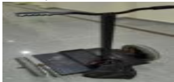
Fig 3. Frame of the SUC, including the handle and wheels

The frame is the most important part of the Segway. It is made up of iron angles that form a rectangle of 22”x20”. The platform will be made up of a perforated metal sheet welded to the frame as shown in Fig.1. The motors and the wheels will also be attached to the frame below. The top part of the frame holds the handle bar and the battery container. The handlebar is made of metal bar that is at optimal average height, designed to be held comfortably. The base of the handlebar is firmly attached to the frame and the handlebar freely rotates in one plane about its axis. The battery container is designed to move back and forth to help balance the Segway at Stand by. This helps the user to begin at the neutral axis to the ground that the Segway will stand on. The frame also constitutes a set of small tyres that will be placed at the front end and the back end of the Segway to prevent the user to bend more than the Segway can handle, this adds a safety feature that helps the user to not fall during his commute.