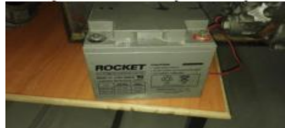
Fig. 7. The Lead –Acid battery used in the SUC

The Segway is powered by a 12Volt, 42 Ampere Hour battery that is used to power cars is shown in Fig.6. One battery is sufficient enough to take the Segway for a minimum of 2 hours. The battery will be placed on the top side of the frame between the leg space area. It has been given the freedom to move back and forth to help balance the Segway as a whole. There is provision to add another battery in this space if more battery life is required.