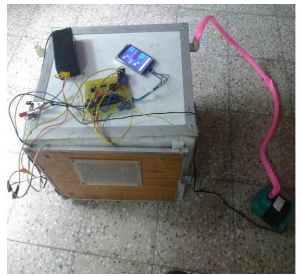
Fig-3 Hardware Implementation