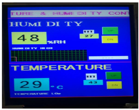
Fig-5 Display of temperature below set point and humidity above set point.

At this state temperature is below set point so heater element will be switched and remain in on state and motor pump, fan will be switched off to decrease humidity.