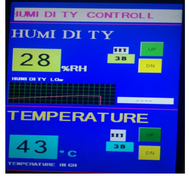
Fig- 4 Display of temperature above set point and humidity below set point.

The HMI screen will display each integer value change in process variable as well as for the set point value we have added a waveform for humidity change and indicating status of low or high values for both the parameters.