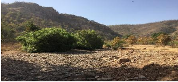
Figure 2. Soil Erosion