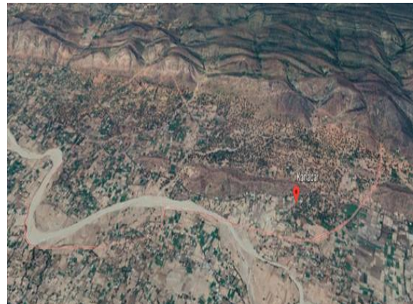
Figure 1. Kanadar Village

Kanadar project is located in vijaynagr Taluka, Sabarkantha District of Gujarat state and it's a cluster of nine micro-watershed. We are selected a Kanadar village from this micro-watershed for surface water conservation. Total Geographical area of this watershed is 1919.3 ha and area proposed to be treated under integrated watershed management is about 1823 ha. The area is characterized by high temperature and low rainfall. The Kanadar watershed project is characterized by heavy runoff of soil with varying slopes. Kanadar project area having totally depended on the rainfall. In this area rainfall is sufficient in this area and will be good for kharif and early rabi crops. The average rainfall of this area is about 818mm with a highest intensity of 1125mm. Area faces continual crop failure that comes on whenever there is a shortfall in the total quantum of rain. Having varying slope range of 4-7% so rain water will be percolated down very fast and cropping of Rabi crop face problem in late maturity periods.