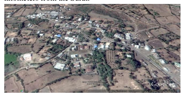
Population of suvali Beach

Suvali village is situated at hazira, taluka choriyasi, district Surat. This village does have a small population of around 560. This village is not more developed though having small primary school and dispensary. Around % of land is available for agriculture near the suvali village some factories or companies were there. Suvali village located at the 31 kilometers from the Surat.