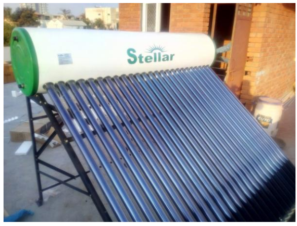
Fig. 3.1 Evacuated Tube Collectors (ETC) based Solar Water Heaters

(c) Fire Tube Boiler- Fire tube is a type of a boiler which uses hot gases to pass through one or more tubes. This tubes consist of flowing water. The walls of tubes are heated by surrounding of hot gases which heat the water to 120°C. At 120°C water converts to steam which is utilized for cooking purpose.