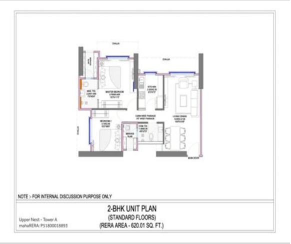
Fig. 2BHK Standard Unit Plan