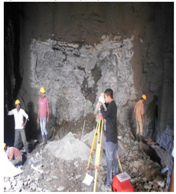
Figure1: Survey profile

This aspect related with payline as per design and types of rock as per site geologist.