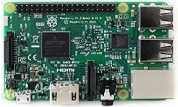
Fig 3.3: Raspberry Pi Model

Raspberry Pi is a small sized single board computer which is capable of doing the entire job that an average desktop computer does like spread sheets, Word processing, Internet, Programming, Games etc. It contain 1GB RAM, 2 USB, ARM V8 Processor and an Ethernet port, HDMI & RCA ports for display,3.5mm Audio jack, SD card slot (bootable), General purpose I/O pins, runs on 5v.