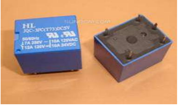
Fig 3.4: Relay

A relay is an electrically operated switch. Relays are used where it is necessary to control a circuit by a separate low-power signal. A relay with calibrated operating characteristics and sometimes multiple operating coils are used to protect electrical circuits from overload. As shown in above figure raspberry pi is connected to the devices via relay. Here relay can be operated as switch to on or off the devices.