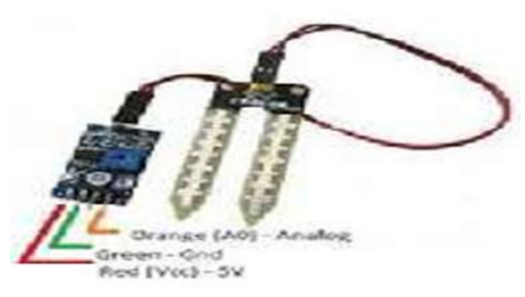
Fig 3.2.1: Soil Moisture Sensor