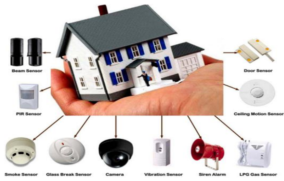
Fig: Components of home security systems

Home security is security at home, places to ensure safety from burgalary. Safety and security of home is a primary concern for all. Latest technologies provide user the ability to handle the electronic appliances. According to FBI, 58% burgalaries in USA involves forcible entry. Accrding to reports, a burglary lasts for 8 to 12 minutes and a burglar is able to break in within 60 seconds. But this project is not just limited to protection of house but provides overall security. In this project we will attempt in providing an overall security at a place. In this project we will try to make a model which is able to detect if someone tries to break the doors, try to break in through walls or any gas leakage happens the system be able to make decisions by itself. IOT is helpful in making such systems and thus we are use it. We are using Arduino(like Atmega328 microcontroller) which is smart enough to make smart decisions. Arduino will be centralized. We are using a microcontroller because firstly it provides digital output, secondly it is cheap and easily available and third it is able to make smart decision at its own. It will receive the information from sensors and will make the decision accordingly. We are using PIR sensor, motion sensors, reed switches, MQ5.