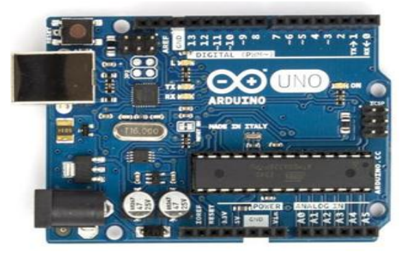
Fig: Arduino board (front and back)