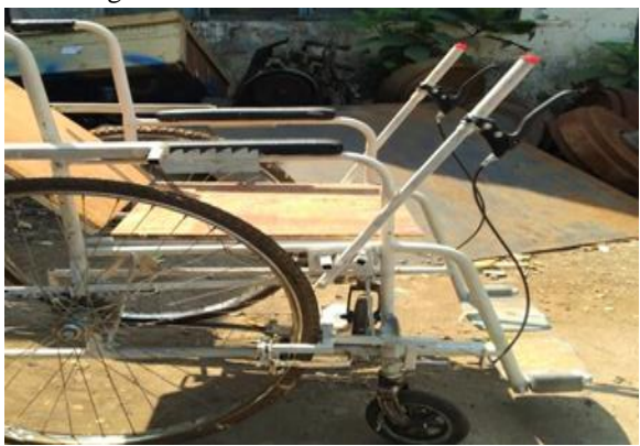
Fig 4.1.1: pivoted lever

The lever mechanism is nothing but mild steel rods which are pivoted at the end of another link where the small piece of roller chair is used at the rack the braking levers are mounted at the end of the main lever to control the speed of wheels and provide the direction to the wheelchair. By applying the brakes on anyone's wheel and moving another lever patient can change the direction of the wheelchair.