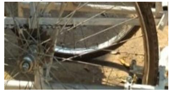
Fig 4.2.1: chain and sprocket use as rack and pinion