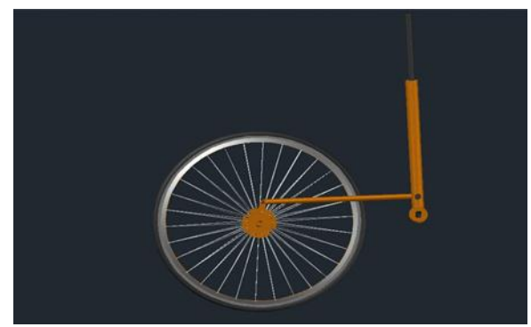
Fig 4.1.2: 3D Model of Lever