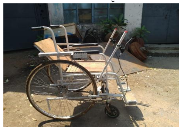
Fig4.3.1: Recliner Mechanism

After reclining if a person (handicapped) tries to move for certain work in a forward direction then the same adjustable hand rest is move in a forward direction with the similar meshing of slots.