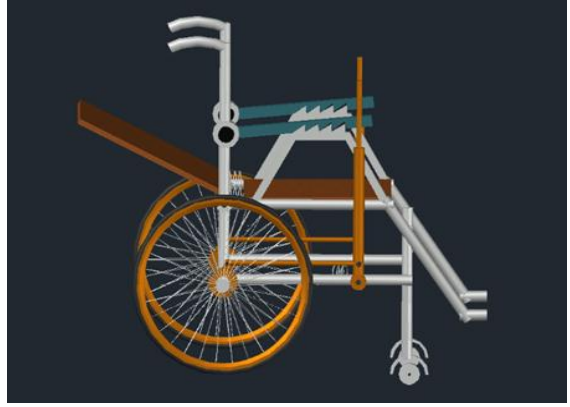
Fig 4.3.2: 3D Model of Recliner Mechanism