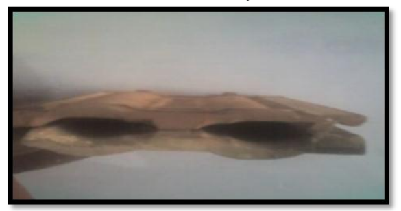
Fig.3Tile Showing the Air Gap Used For Thermal Insulation