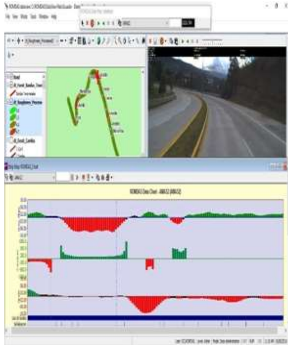
Fig 3 IRSM output