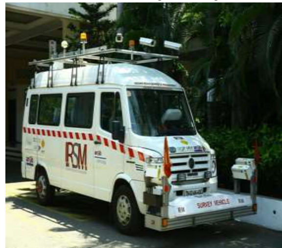
Fig 2. IRSM

In the Pune, the art equipment including IRSM are used to assess the structural and functional conditions of the pavement. From the IRSM testing: roughness (ride), rut depth, surface macro texture and surface distress results were collected and layer modulus and remaining structural life were calculated and reported. Also Motion study the current axle loading was determined for evaluating remaining life