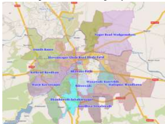
Fig 1. Map showing road network of Pune City

The population of the Pune has been growing rapidly, between 2001 and 2011; the city grew by 12.6%, increasing from 2.5 million to 3.5 million. The decadal growth rate of Pune for the last 10 years has been at least 12.5% and it's estimated that population in 2019 is 7.1264 Million. There has been an unprecedented increase in the traffic volume over recent years. The number of motor vehicles registered in the Pune has reached to 36.27 lakh, from 33.37 lakh the previous year (2016-2017). Currently, the road network in the Pune is one of the main options to serve the growing needs of the transportation from the public and private sectors. Other modes, such as metro are in the process of development. Therefore, maintaining roads in the Pune at a high level of service is greatly needed.