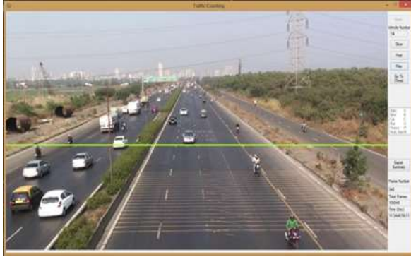
Fig.2 Traffic counting