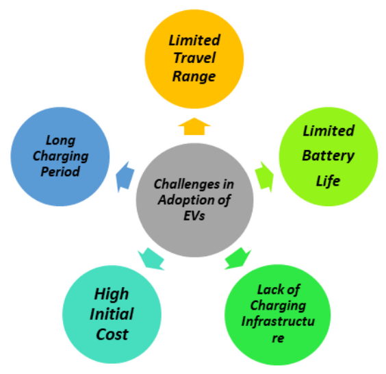
Figure 2: The Major Challenges In The Adoption of EVs.

Before buying a vehicle, few concerns arise from the consumer's perspective which is dependent on technical and financial challenges. Therefore, the consumers have anxiety in the acceptance of EVs as compared to ICEs.