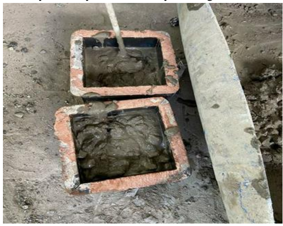
Figure-2 Concrete cubes while casting