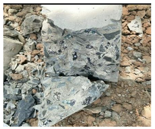
Figure-6 Slag in failed specimen