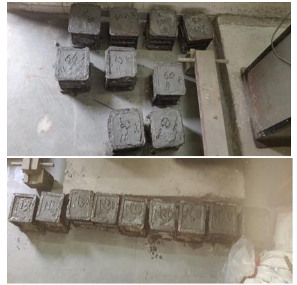
Figure-1 Concrete cubes with green concrete