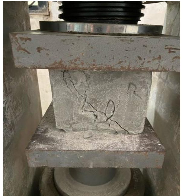
Figure-3 Concrete cubes while testing