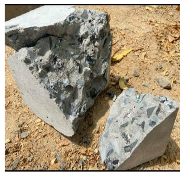
Figure-4 Failed Cube Specimen