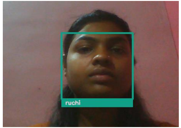
Fig. Facial Recognition Using Raspberry Pi

In any IoT device needs at least one microcontroller device to function properly. In this system we use Raspberry Pi microcontroller for processing.