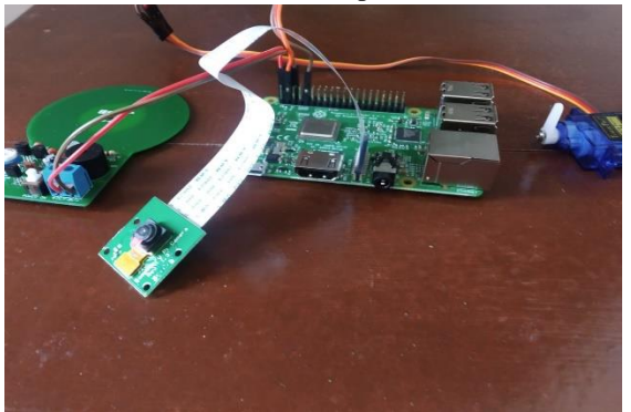
Fig. Rpi model

The system must have the metal detector sensors to identify the attributes of the weapons so it could easily identify it. In the proposed system if any kind of weapon is detected then an alert message is sent to the authorized user as well as the police.