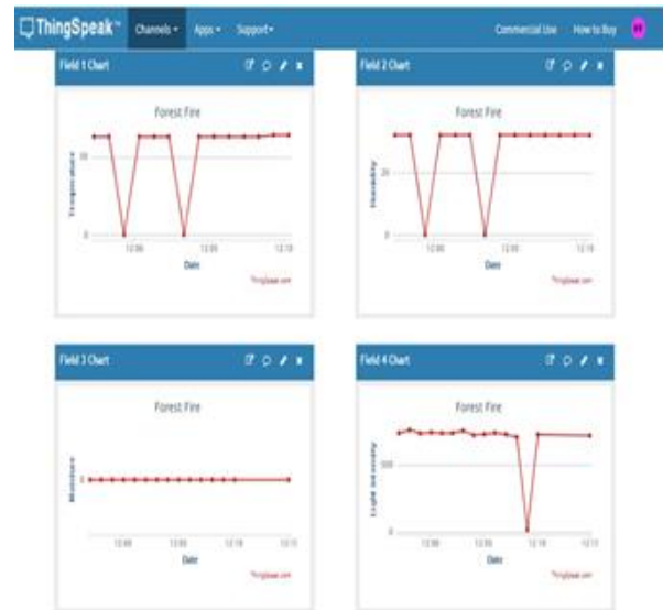
Fig 3(a) Graphs on CLOUD API