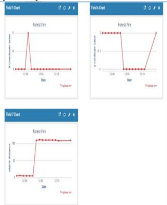
Figure: 3(b) Graphs on CLOUD API