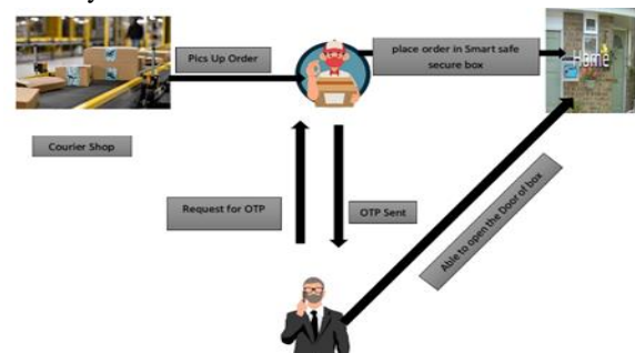
Fig.3. Proposed IoT System for smart safe box

So this type of user can easily save their product from theft and also forensic people can send evidence securely from crime scene to destination.