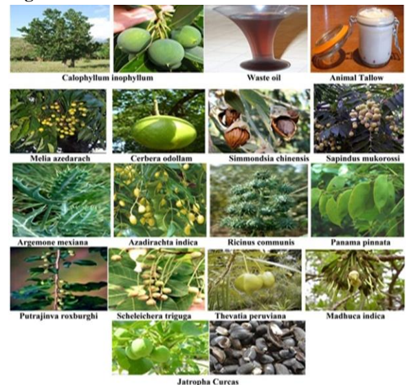
Figure 1B:Non-edible Oil Feedstock