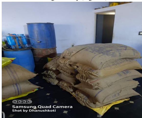
Figure 3: Gunny bag type of storage practices

height of filled bag is 30 cm. This bag can store 93 Kg of Wheat and 75 Kg of Paddy (Figure 3).