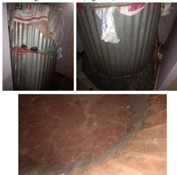
Figure 2: Metal bin type of storage practices

Metal bins made up of steel, aluminium RCC are used for storage of finger millet grains inside and outside the house in some regions of Mysuru, Mandya, Hassan, Tumkur & Chamarajanagara belonged to southern dry zones of Karnataka. These bins are fire and moisture proof. The bins have long durability and produced on commercial scale. The capacity ranges from 50 kg to 10 tonnes (Figure 2).