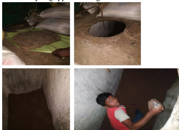
Figure 1: Hagevu type of storage practices