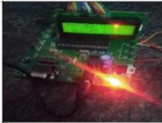
Fig4.: Output when gestures are matched