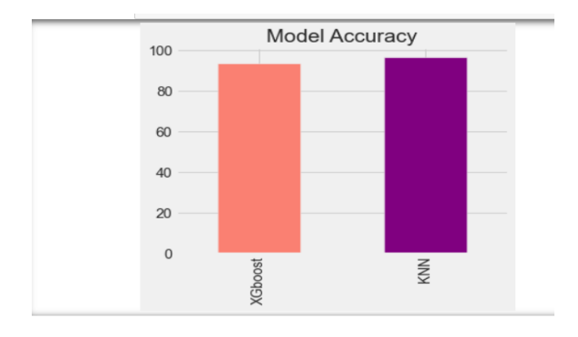
Fig5:Comparison of Accuracy with existing system