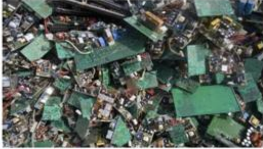
Figure. 1 E-waste