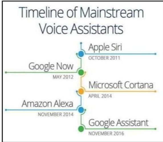
Figure 1: Timeline of Main Voice Assistants

So with a capable virtual assistant, we will be able to control many things around us single-handedly with only one platform.