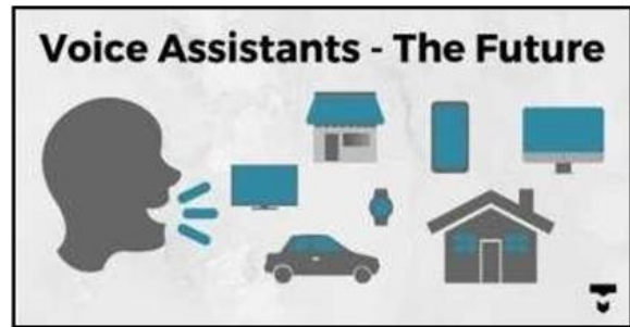
Figure 2: Voice Controlled Appliances Affecting Our Daily Life

As per Nil Goksel-Canbek Mehmet Emin Mutlu- “This has been helpful in day-to-day lifestyle. From mobile phones to personal desktops to mechanical industries these assistants are in very much demand for automating tasks and increasing