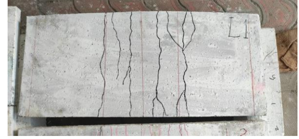
Fig .5 Crack pattern for Ferrocement slab with single layer of mesh