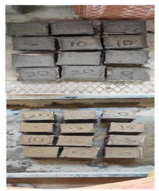
Fig. 1 Preparation of Mould and Casting of Specimen

At first cement, m-sand, granite waste mixed dry. After dry mixing add water and admixture in dry mix. Ferrocement mortar are placed in mould with proper manner. Specimens were demoulded after 24 hours and allow in curing tank for 28 days.