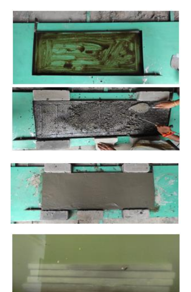
Fig. 2 Prepartion Of Mould Casting & Curing Of Slab

6.3 PROCEDURE FOR FLEXURAL TEST ON FERROCEMENT SLAB: