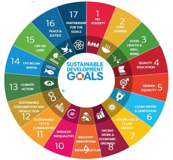
Fig. 1: Sustainable Development Goals