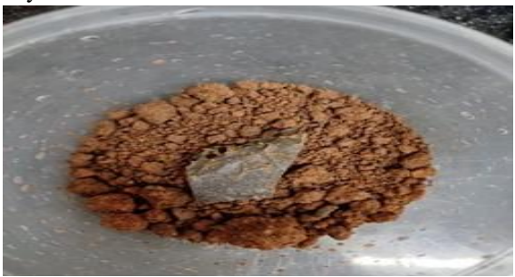
Fig. 4 Soil degradation studies

Approximately 0.4 gm of a pre-weighed piece of bioplastic was taken and was placed inside a beaker containing soil at a depth of 5 cm from the surface (fig. 4). Water was sprinkled on the soil so that bacterialenzymatic activities could be enriched. These samples were kept in the beaker for 9 days and the weight of the bioplastic was noted every three days.