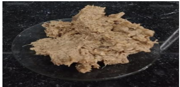
Fig. 2 Ground banana peels

Banana peels were manually removed from the edible portion of the banana and cut into smaller sizes in the range of 2 \pm 0.5 cm in length. These banana peels were boiled in water for about 30 minutes. Water was decanted from the beaker and the peels were left to dry on filter paper for about 1-2 hours. After complete drying the peels were transferred to a grinder and ground well to form a paste (fig. 2).