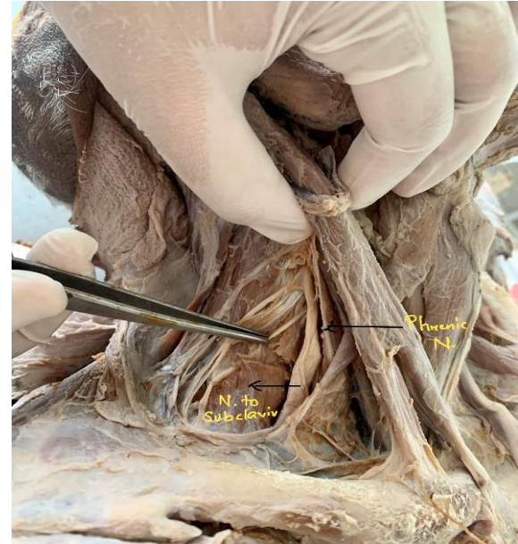
FIGURE 3: Showing phrenic nerve, nerve to subclavius