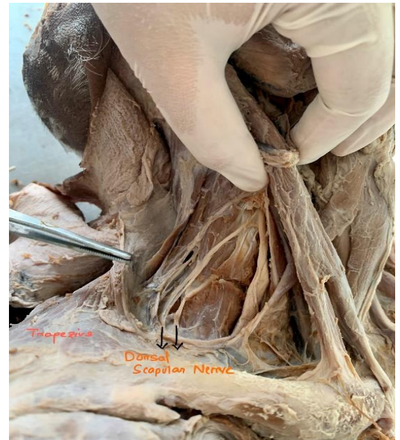
FIGURE 4: showing trapezius, dorsal scapular nerve