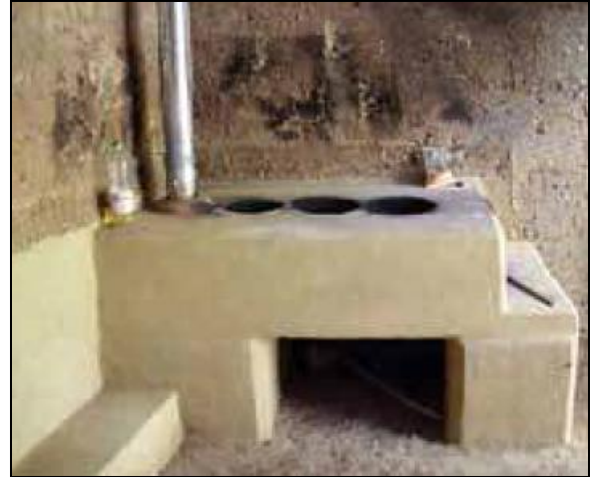
Fig. 1. Chimney installation.

Depending on the material, structure and filtering process, chimney filter types are classified into 3 categories.