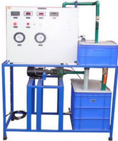
Fig. 1. Experimental set-up of reciprocating pump

The following are the steps for the performance testing of a double acting reciprocating pump: