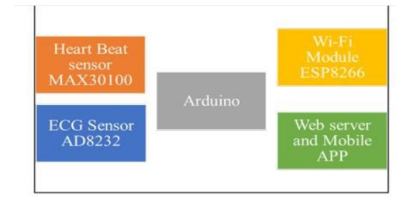
Fig. 2 shows the design of the IoT device-based ECG system