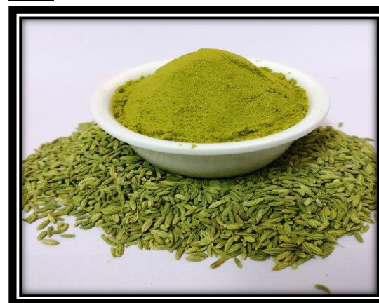
Fig. No. 1 (Fennel )