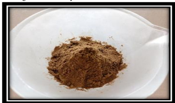
Fig. No.2 – (Face Pack)

Observation: Rheological findings justified the flow properties of the face pack as it was found to be free flowing and non-sticky in nature.