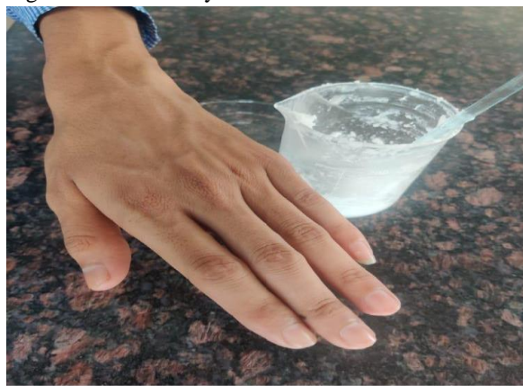
Figure -11 result after the sensitivity test

The above pictures show the before and after results of sensitivity test.