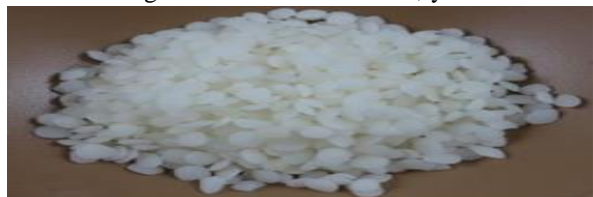
Figure -2 Bees wax

Beeswax is one of the most important ingredients in home-made cosmetics. Why on earth I haven't yet written a word about beeswax? Maybe beeswax is just so self-evident that I haven't even thought about it. However, beeswax is the most versatile ingredient that suits perfectly to the skin. The beeswax itself is clear and transparent. Worker bees chew the beeswax which brings propolis to wax. The pollen carried by the worker bees gives to beeswax its clear, yellow colour.