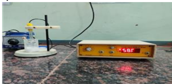
Figure -12 PH meter

The pH of aloe cold cream was determined using pH meter. The most accurate common means of measuring pH is through a lab device called a probe and meter, or simply a pH meter. The probe consists of a glass electrode through which a small voltage is passed. The meter is a voltmeter, measures the electronic impedance in the glass electrode and displays pH units instead of volts. Measurement is made by submerging the probe in the semisolid until a reading is registered by the meter.