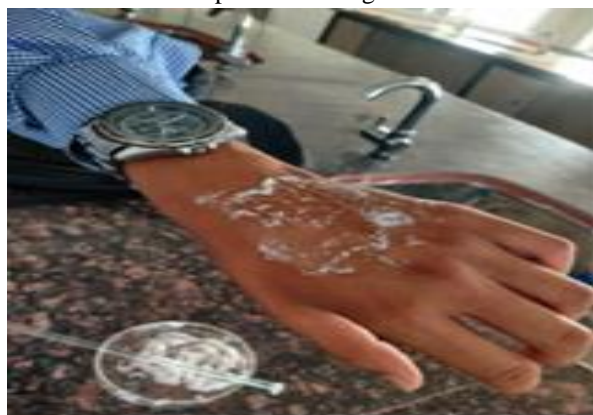
Figure -10 sensitivity test

The cream which was prepared has applied on 1cm skin of hand and exposed to sunlight for 4-5mins.