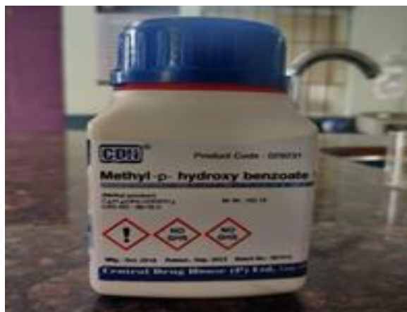
Figure -8 Preservative