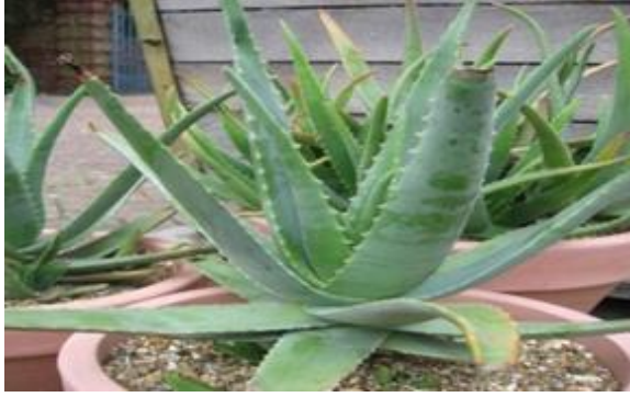
Figure -5 Aloe vera