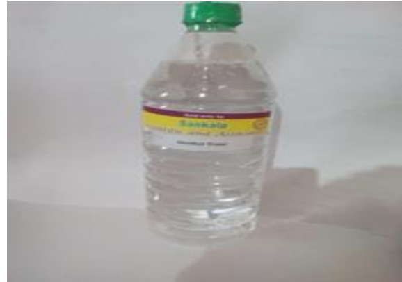
Figure -7 Distilled water

Distilled water is water that has been boiled into vapor and condensed back into liquid in a separate container. Impurities in the original water that do not boil below or near the boiling point of water remain in the original container. Thus, distilled water is a type of Purified water. purified water is water that is essentially free of microbes and chemicals. This is achieved by reverse osmosis (forcing the water through a membrane to get rid of chemicals, minerals and microbes), ozonisation (disinfecting water using ozone rather than a chemical), or distillation. The EPA requires purified water to not contain more than 10 parts per million of total dissolved solids in order to be labelled purified water. Distilled water is a type of purified water. Salts, minerals, and other organic materials are removed by collecting the steam from boiling water.