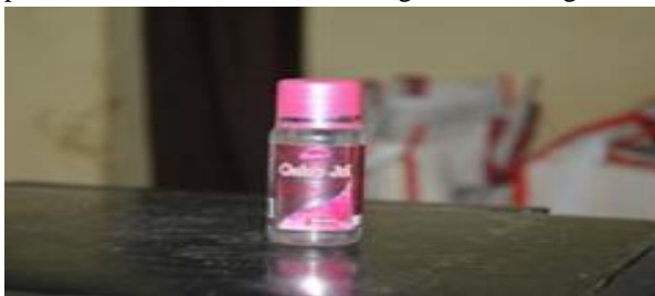
Figure -6 Rose water

Rose water is created by distilling rose petals with steam. Rose water is fragrant, and it's sometimes used as a mild natural fragrance as an alternative to chemical-filled perfumes. Rose water has been used for thousands of years, including in the Middle Ages. It's thought to have originated in what is now Iran. It's been used traditionally in both beauty products and food and drink products. It also comes with plenty of potential health benefits, including the following.