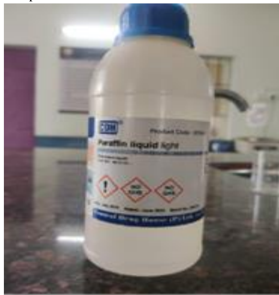
Figure -4 Liquid paraffin

with the paraffin (or kerosene) used as a fuel. It is a transparent, colorless, nearly odourless, and oily liquid that is composed of saturated hydrocarbons derived from petroleum.