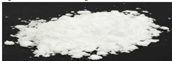
Figure -3 Borax

Borax is used in lotions and creams. Borax is combined with wax to improve the consistency of lotions and creams. It also work as an emulsifier when used with wax and it is mostly used in hand soaps. It is excellent ingredient used for cleaning as it's alkaline in nature.