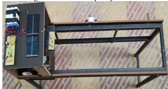
Figure 2: Sky Track

The project aims to revolutionize urban transportation by introducing an innovative and sustainable mode of travel powered by renewable energy sources like solar power. Its key objectives include reducing carbon emissions, addressing urban congestion and pollution, and offering a high-capacity transportation solution. The sky bus system operates on solar energy, minimizing environmental footprint and contributing to cleaner air quality in cities. Integration of wireless charging technology eliminates the need for conventional fuelling stations, enhancing passenger convenience and reducing logistical challenges. The project showcases technological innovation and promotes sustainable transportation practices globally. Challenges include initial investment costs, regulatory frameworks, and factors affecting solar energy generation. Overall, the sky bus with wireless charging using solar energy represents a significant advancement in greener and smarter urban transportation systems, with the potential to transform commuting and enhance the quality of life in cities.