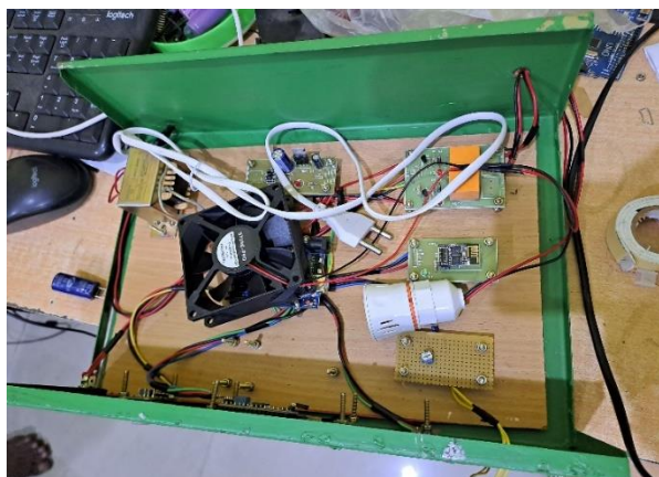
Fig 3.2 Working Model of Smart Onion Monitoring System