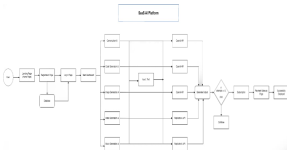
DIG 2: WORKING DIAGRAM