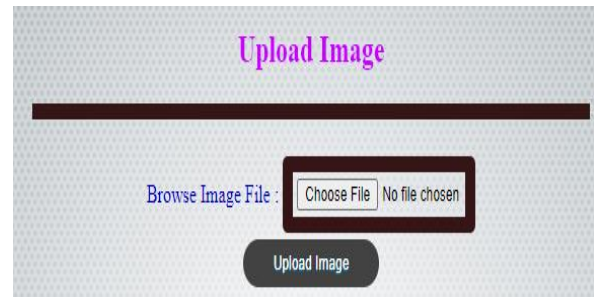
Figure 3: Training data set by uploading accident images