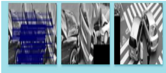
Figure 7: Showing image comparison between images