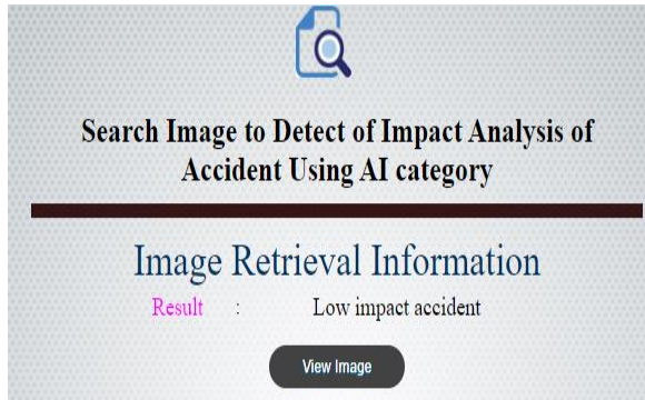
Figure 6: Showing result low impact analysis