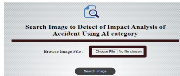
Figure 5: User can check accident impact analysis by uploading accident images