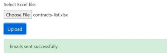
Figure 5: Front end site after sending email successfully